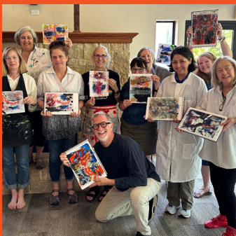
Classes will be held in the Lakeview Room.