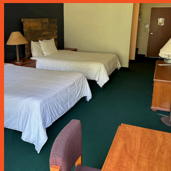
Registration includes a private room.