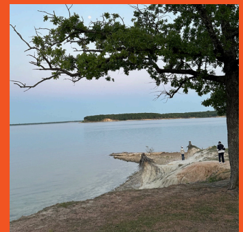
Nature walks, bonfires and comraderie.