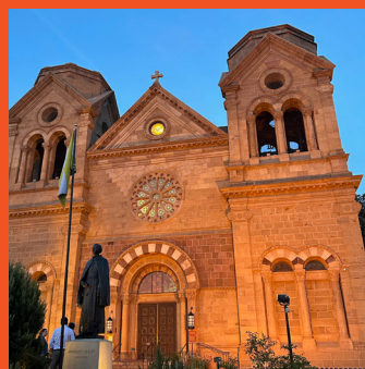
Enjoy the historic sites of Santa Fe.