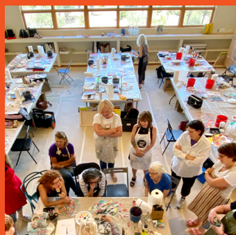
Large studio with incredible views.