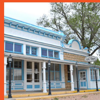
Plan an afternoon in Lamy, New Mexico.