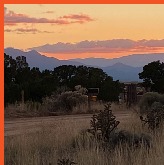
Santa Fe sunsets are incredible.